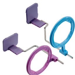
SMART POSITIONER FOR PHOSPHOR PLATE

Flow's patented SMART system makes using phosphor plates just as easy, familiar, and convenient as film.