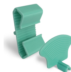
ALL-BITE SENSOR HOLDER