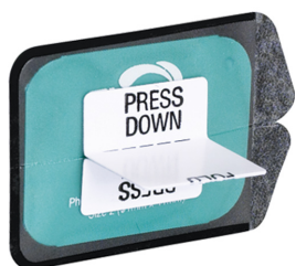
STICKEMS, ADHESIVE BITEWING TABS