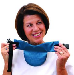
LEAD THYROID COLLAR

Quick Release Collar offers the same look and comfort as our model 621U, but without the hook & loop closure. Rear buckle closure. Available in our wide selection of nylons, ripstops and designer fabrics.