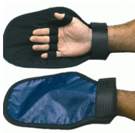
OPEN PALM SHIELD