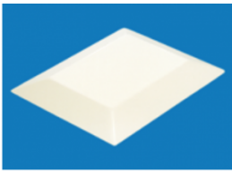
INGOT OCTOSTOP FILTER CODE OCT-02V