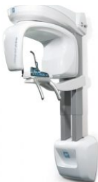
ROTOGRAPH PRIME - OPG