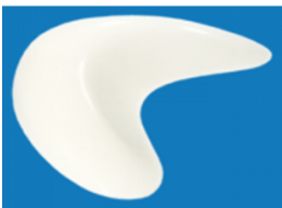
BOOMERANG OCTOSTOP FILTER CODE OCT-01V