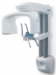
ROTOGRAPH PRIME 3D - CBCT

Rotograph Prime 3D is a new dental imaging system.