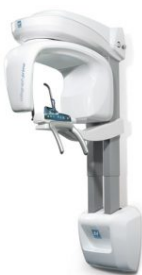
VILLA ROTOGRAPH PRIME DIGITAL OPG SYSTEM