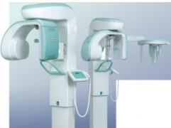
OPG CBCT 3D DENTAL SYSTEM