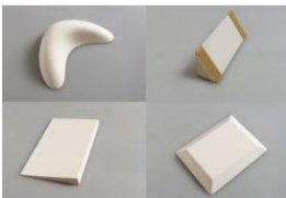
BOOMERANG/IN GOT/GENTLE SLOPE/LITTLE PRISM CODE OCT-KIT