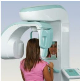
VILLA ROTOGRAPH EVO D OPG