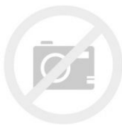
X-RAY ON LIGHT *