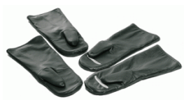
LEAD MITTENS CODE PS101MIT