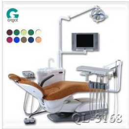
GRACE DENTAL CHAIR QL-3168

The GRACE Dental Unit is a combination of superior Quality, Hygiene, Performance Technology and Ergonomics. Made in Taiwan.