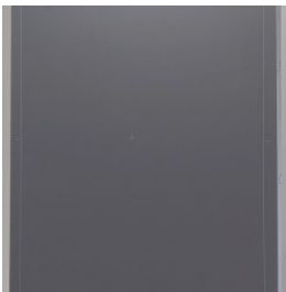
FULL SPINE DR PANEL LONGTAIL