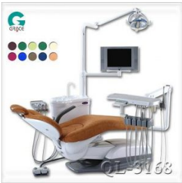
GRACE DENTAL CHAIR QL-3168

The GRACE Dental Unit is a combination of superior Quality, Hygiene, Performance Technology and Ergonomics. Made in Taiwan.