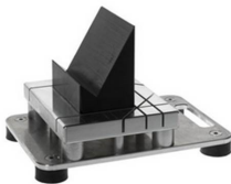
PODOBLOCK. 170 CODE PPB01AL170