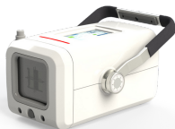
ATX PORTABLE X-RAY GENERATOR 1.8KW