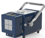
ATX PORTABLE X-RAY GENERATOR 2.4KW