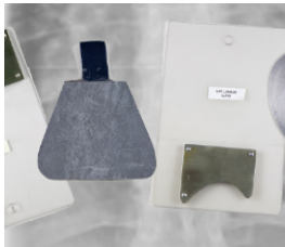
FULL SET SPINE FILTERS

Complete box set of all Full Spine Filters. Reduce Radiation dose by up to 95%.