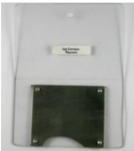
NOLAN FILTER LATERAL CERVICO THORACIC

Accommodates relative thickness of the shoulder to the Cervical or Thyroid region.