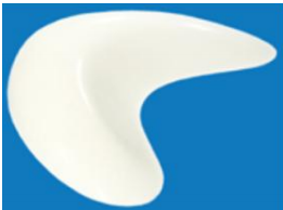
OCTOSTOP CHAINLESS BOOMERANG

Regular Boomerang with no chain. PRICE: TBA