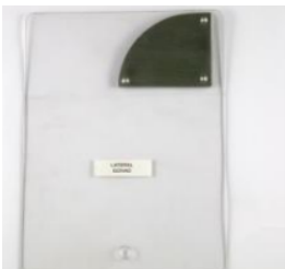
NOLAN FILTER, LATERAL GONAD

Lateral M/F Gonad shield for lateral exposures