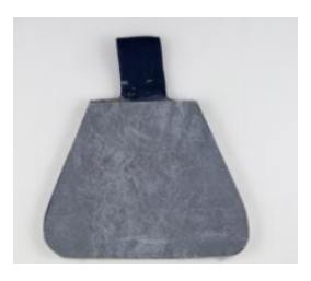
NOLAN FILTER, A-P MALE GONAD