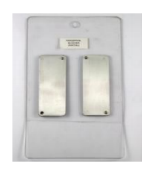
NOLAN FILTER, A-P PARASPINAL BLOCKER (PARTIAL)

A-P Paraspinal Blocker (Partial): Partially blocks anatomy either side of the spine.