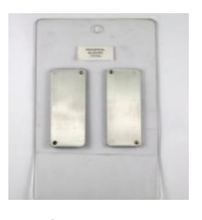
NOLAN FILTER, A-P PARASPINAL BLOCKER (TOTAL)

A-P Paraspinal Blocker (Total): Totally blocks anatomy either side of the spine.