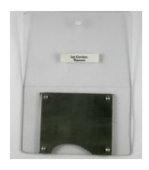
NOLAN FILTER LATERAL CERVICO THORACIC

Accommodates relative thickness of the shoulder to the Cervical or Thyroid region.