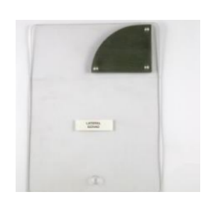
NOLAN FILTER, LATERAL GONAD

Lateral M/F Gonad shield for lateral exposures