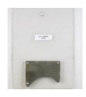
NOLAN FILTER, LATERAL LUMBAR LUNG

Lateral Lumbar Lung: Lumbar Lung shield for lateral exposures