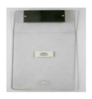
NOLAN FILTER, LATERAL THORACIC