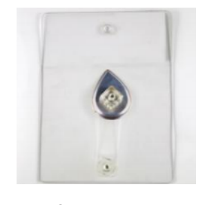
NOLAN FILTER, LATERAL SPINOUS

Lateral Spinous: Reduces scatter and skin dose and