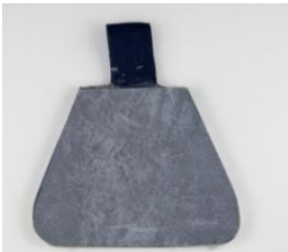
NOLAN FILTER, A-P MALE GONAD