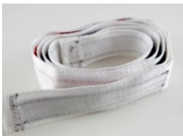
NOLAN FILTER, GONAD SYSTEM BELT