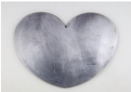
NOLAN FILTER, A-P FEMALE GONAD SHIELD