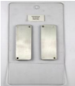
NOLAN FILTER, A-P PARASPINAL BLOCKER (PARTIAL)

A-P Paraspinal Blocker (Partial): Partially blocks anatomy either side of the spine.