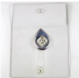
NOLAN FILTER, LATERAL SPINOUS

Lateral Spinous: Reduces scatter and skin dose and