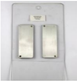
NOLAN FILTER, A-P PARASPINAL BLOCKER (TOTAL)

A-P Paraspinal Blocker (Total): Totally blocks anatomy either side of the spine.