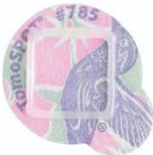
BEEKLEY NEW TOMOSPOT® 785

Distinctly identify and permanently document nipples, moles, scars, palpable masses, and areas of pain or concern on mammography images with BeekleySPOT® skin markers for mammography. The result is clear communication between patient, technologist and radiologist regarding areas of interest and more precise interpretation of the mammography.