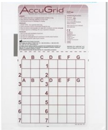
BEEKLEY ACCUGRID®300 4.65"

AccuGrid® Specimen Localizing Grid System 300