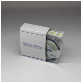
BEEKLEY LOCALIZERS™ 210