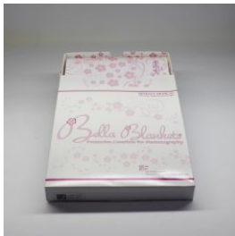
BEEKLEY BELLA BLANKETS®310

Bella Blankets ® protective coverlets 310