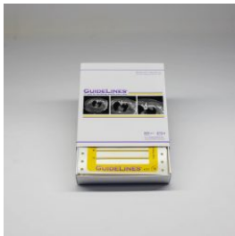
BEEKLEY GUIDELINES® CT BIOPSY GRID 117

Guidelines® CT Biopsy Grid 117 Ref: 117, (QTY: 20/box)