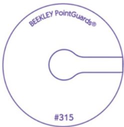
BEEKLEY POINTGUARDS® 315