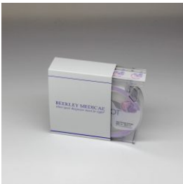
BEEKLEY NEW TOMOSPOT® 784

Distinctly identify and permanently document nipples, moles, scars, palpable masses, and areas of pain or concern on mammography images with BeekleySPOT® skin markers for mammography. The result is clear communication between patient, technologist and radiologist regarding areas of interest and more precise interpretation of the mammography.