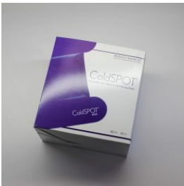
BEEKLEY COLDSPOT® 500