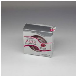
BEEKLEY V-SPOT®703 FLORALS®