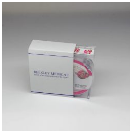
BEEKLEY A-SPOT® 651 FLORALS®

A-SPOT® Light Image® palpable mass marker 651 Florals®