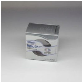
BEEKLEY NEW TOMOSPOT® 782