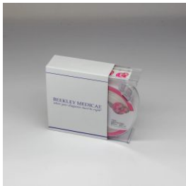
BEEKLEY X-SPOT® 601 FLORALS®