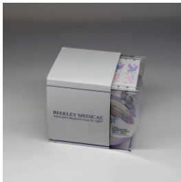
BEEKLEY TOMOSPOT® 781