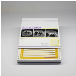
BEEKLEY GUIDELINES® CT BIOPSY GRID 217