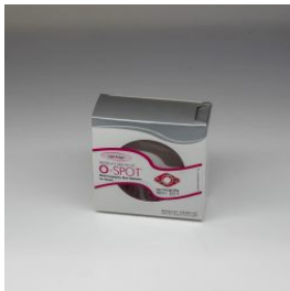
BEEKLEY O-SPOT® LIGHT IMAGE® 652 FLORALS