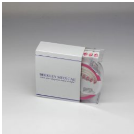
BEEKLEY S-SPOT® 677 FLORALS®

S-SPOT® Light Image® Soft 'n Stretchy® 677 Florals®