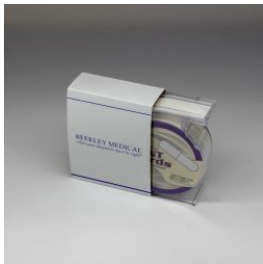
BEEKLEY POINTGUARDS® 215