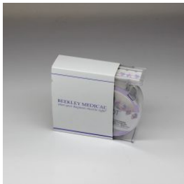
BEEKLEY NEW TOMOSPOT® 783

Distinctly identify and permanently document nipples, moles, scars, palpable masses, and areas of pain or concern on mammography images with BeekleySPOT® skin markers for mammography. The result is clear communication between patient, technologist and radiologist regarding areas of interest and more precise interpretation of the mammography.