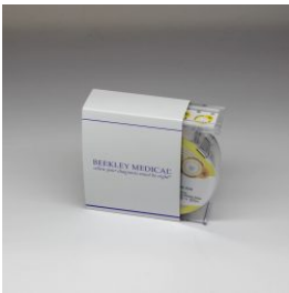
BEEKLEY CT- SPOT® 119