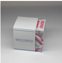
BEEKLEY N- SPOT® 790 FLORALS®