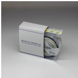
BEEKLEY LOCALIZERS™ 211