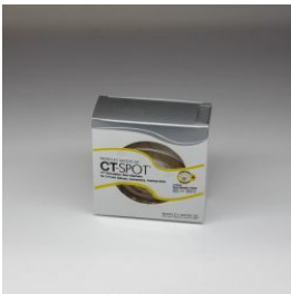
BEEKLEY CT- SPOT® 120

Ideal for marking 3-point set-ups and isocenters, these unique markers image brightly during simulation without streaking or artifact.