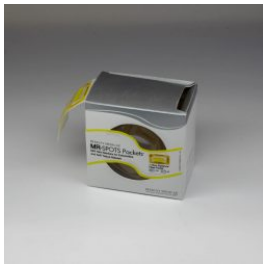
MR-SPOT PACKETS™ 185