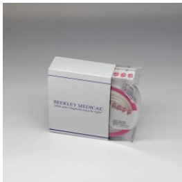
BEEKLEY S-SPOT® 607 FLORALS®

S-SPOT® CT Simulation Marker 607 Florals®