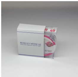
BEEKLEY A-SPOT® 651 FLORALS®

A-SPOT® Light Image® palpable mass marker 651 Florals®