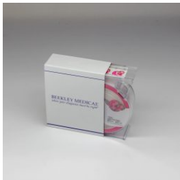
BEEKLEY X-SPOT® 601 FLORALS®