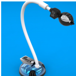
AKUCAL IMAGE SCALING DEVICE ( 30MM ) (COMPLETE)