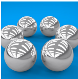
AKUCAL SCALING TOOL ( 30MM REPLACEMENT MARKER )